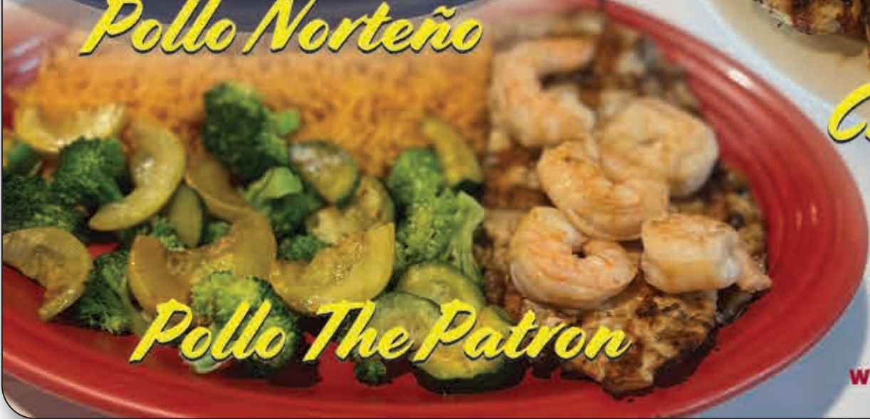
Pollo The Patron